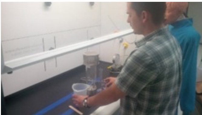
HAM Test on Unit Similar to Hybrid Isolator and Standard Fume Hood Respectively